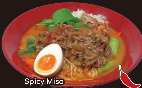
Spicy Miso Sukiyaki Beef $17.60