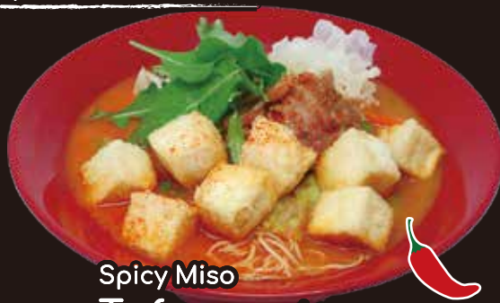
Spicy Miso Tofu $15.80