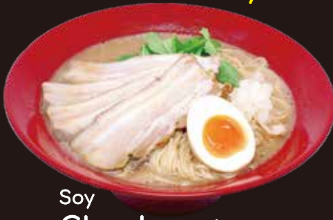
Soy Chashu $16.80