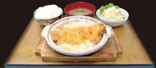
Katsu Egg $18.00