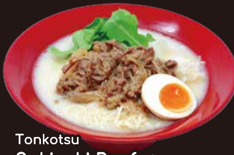
Tonkotsu Sukiyaki Beef $15.80