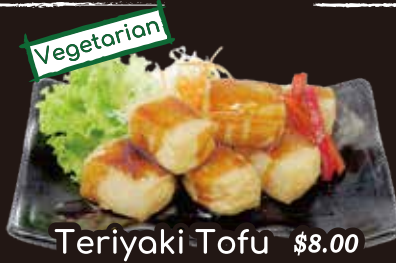
Teriyaki Tofu $8.00