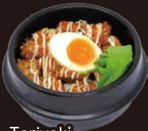
Teriyaki Chicken $11.00