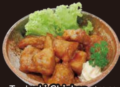
Teriyaki Chicken $13.00