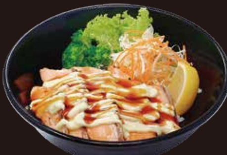
Wasabi Mayo Salmon $16.00