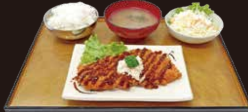
Chicken Katsu $18.00