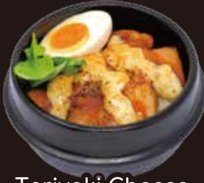
Teriyaki Cheese Chicken $11.00