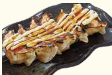
Teriyaki Wasabi Mayo (6pc) $6.80 / (12pc) $12.00