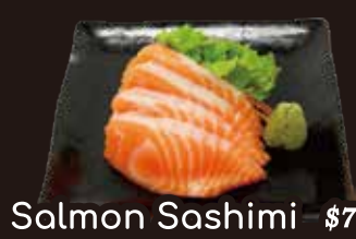
Salmon Sashimi $7.00