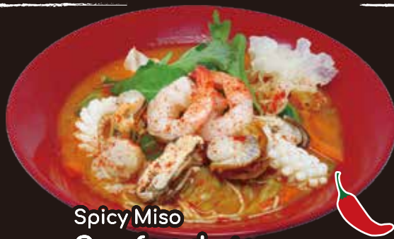
Spicy Miso Seafood $18.80