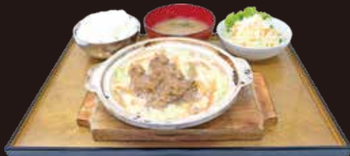
Sukiyaki Egg $18.00