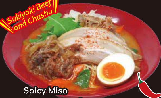
Spicy Miso Nikumori $18.60