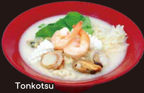
Tonkotsu Seafood $17.00