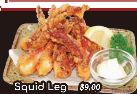
Squid Leg $9.00