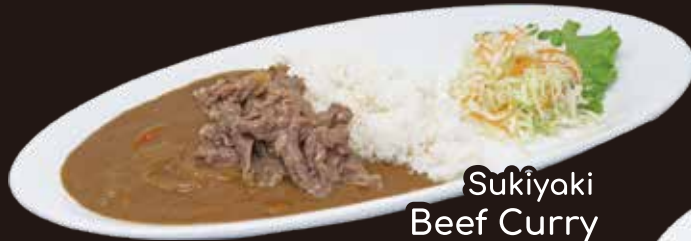
Sukiyaki Beef Curry $13.60