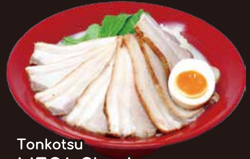
Tonkotsu MEGA Chashu $19.80