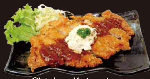
Chicken Katsu $13.00