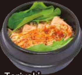
Teriyaki Salmon $11.00