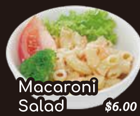
Macaroni Salad $6.00