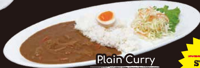
Plain Curry $10.00