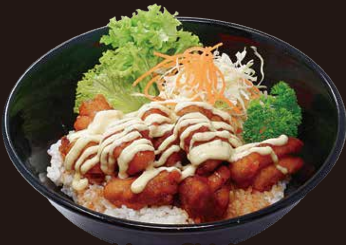
Wasabi Mayo Chicken $13.80