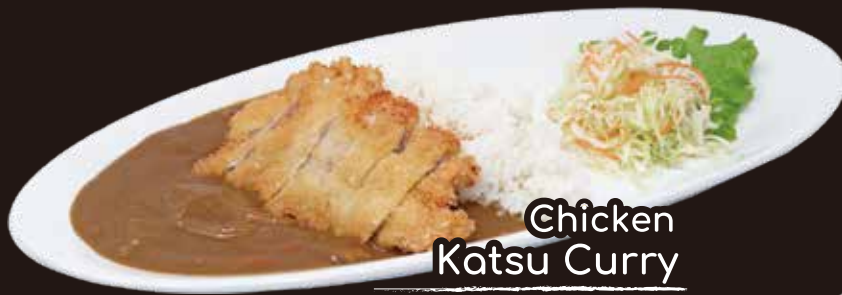
Chicken Katsu Curry $15.80