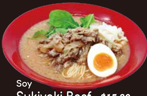
Soy Sukiyaki Beef $15.80