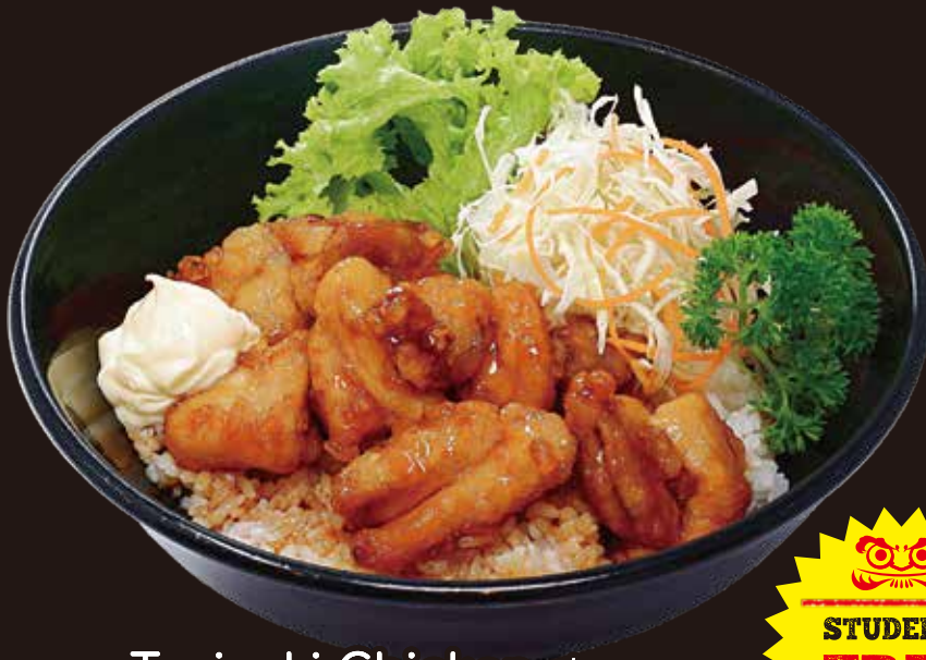
Teriyaki Chicken $13.80