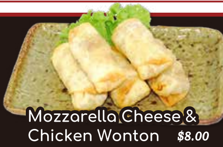
Mozzarella Cheese & Chicken Wonton $8.00