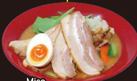
Miso Chashu $18.60