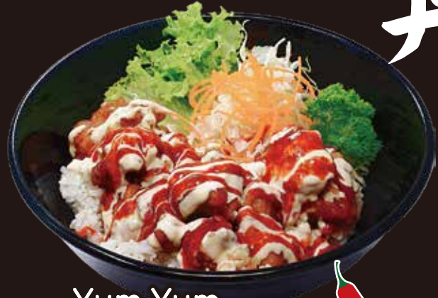
Yum Yum Spicy Chicken $13.80