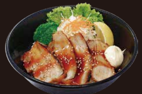
Grilled BBQ Pork $13.80