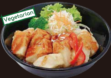
Teriyaki Tofu $13.80