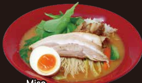
Miso Ramen $14.80