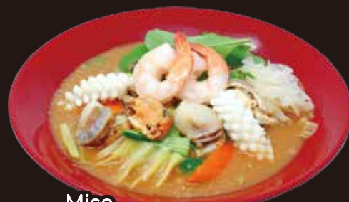
Miso Seafood $18.50