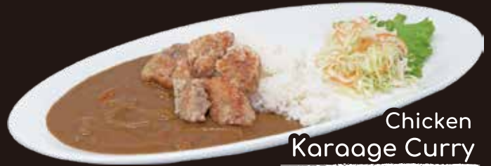
Chicken Karaage Curry $14.60