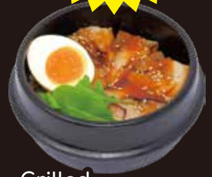
Grilled BBQ Pork $11.00