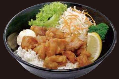
Chicken Karaage $13.80