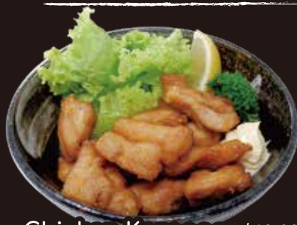
Chicken Karaage $13.00