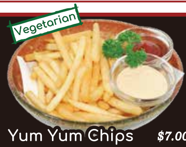
Yum Yum Chips $7.00