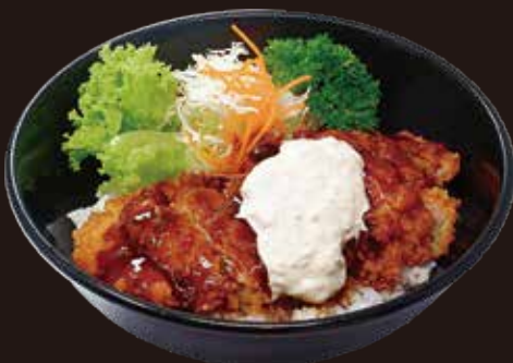
Chicken Katsu $16.00