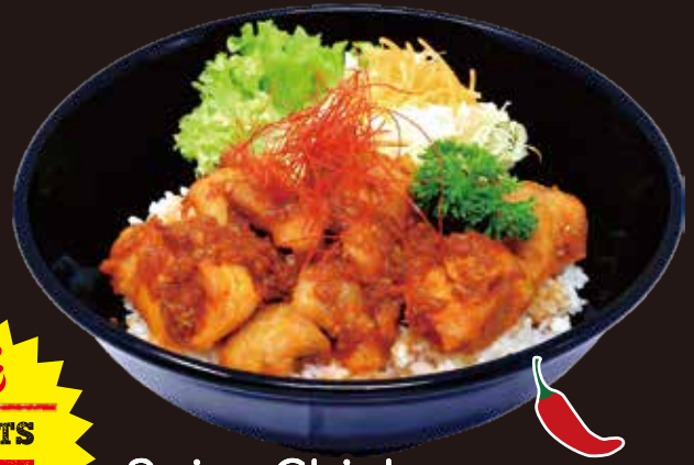
Spicy Chicken $13.80