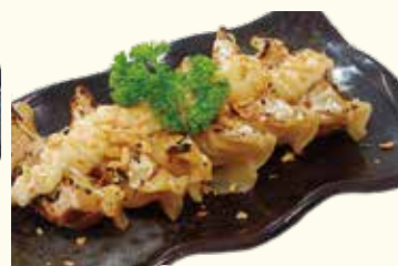
Garlic Cheese (6pc) $6.80 / (12pc) $12.00