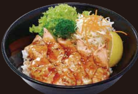
Aburi Salmon $16.00