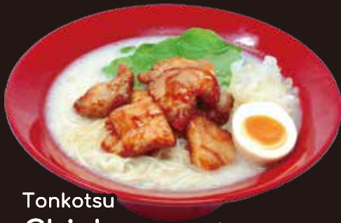
Tonkotsu Chicken $15.80