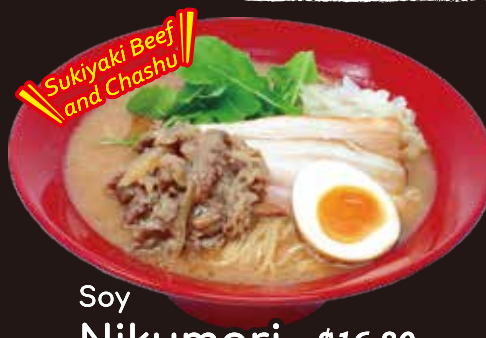
Soy Nikumori $16.80