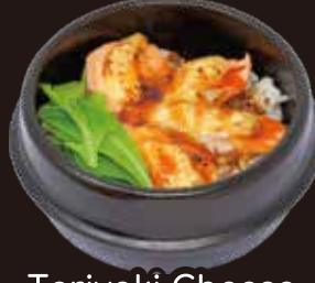
Teriyaki Cheese Salmon $11.00