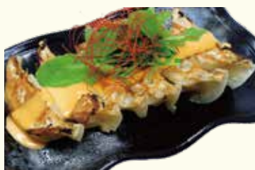
Spicy Mayo (6pc) $6.80 / (12pc) $12.00