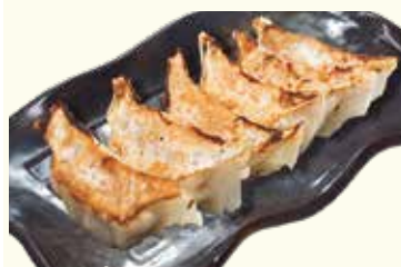
Japanese Gyoza (6pc) $6.80 / (12pc) $12.00

It has a unique, full flavour as it is housemade while using Japanese method. We use top-grade chicken stock made from simmering a whole chicken which results in a very rich Umami-flavoured stock. It is simple but has noticeable deepness.