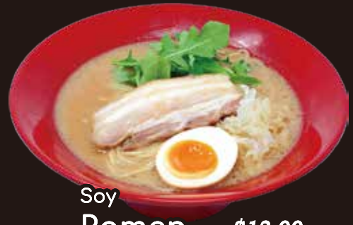
Soy Ramen $13.00

Vegetarian Soy Ramen available. / Ask our staff to order.