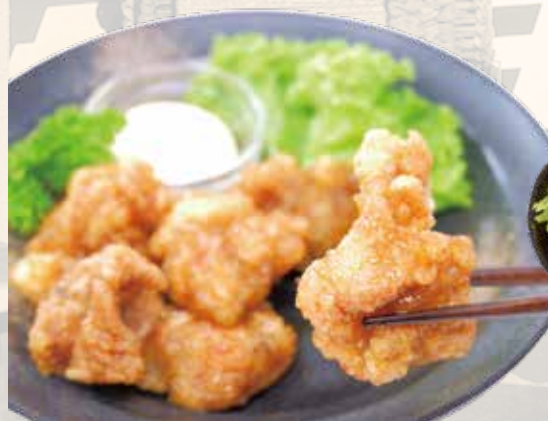
照り焼き わさびマヨ Teriyaki Wasabi 9.8