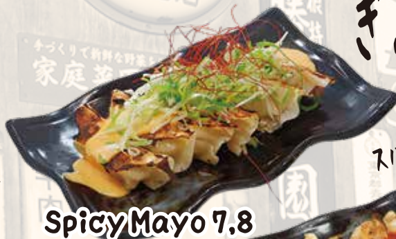
Spicy Mayo 7.8