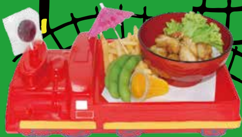
Kids Chicken on Rice