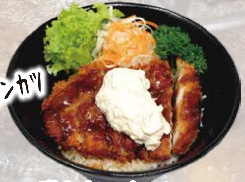
Chicken Katsu $16.8