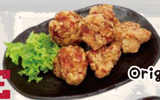
オリジナル Original 9.4

It is juicy Chicken Karaage made with Daruma's signature recipe.