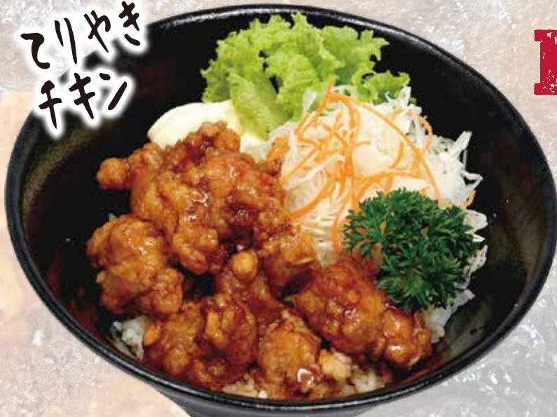
Teriyaki Chicken 15.8