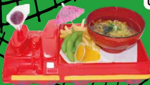
Kids Soy Ramen