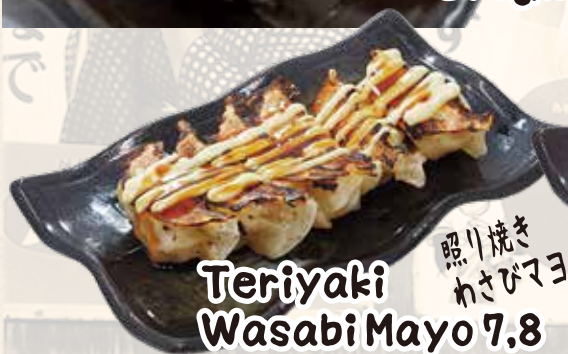
照り焼き わさびマヨ Teriyaki Wasabi Mayo 7.8