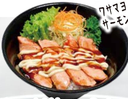
Wasabi Mayo Salmon 17.6