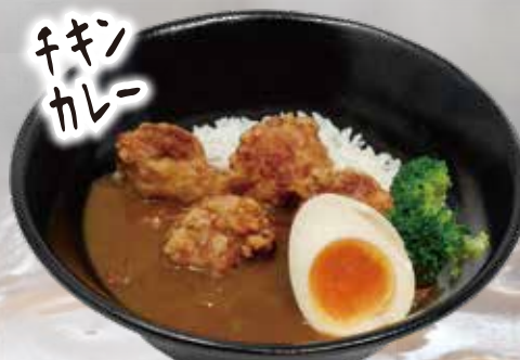
Chicken Karaage Curry 16.8