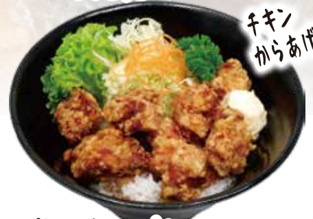
Chicken Karaage 14.8