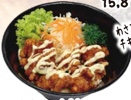
Wasabi Mayo Chicken 15.8