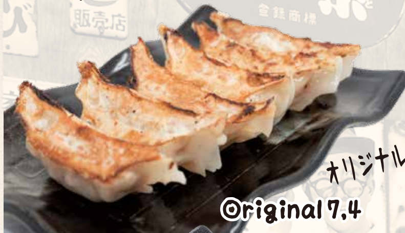
オリジナル Original 7.4

It has a unique, full flavour as it is housemade while using Japanese method. We use top-grade chicken stock made from simmering a whole chicken which results in a very rich Umami-flavoured stock. It is simple but has noticeable deepness.