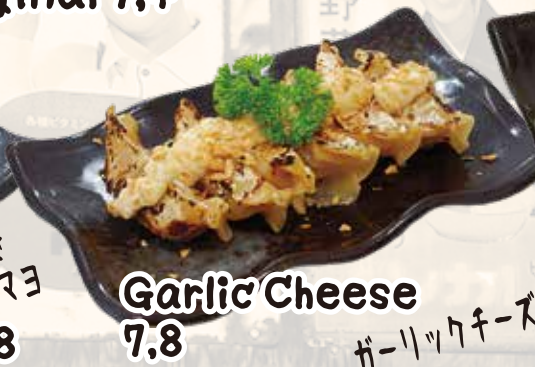
Garlic Cheese 7.8 ガーリックチーズ