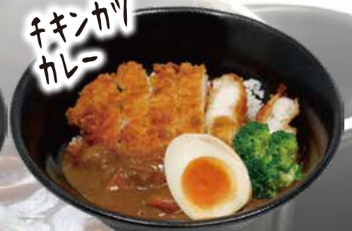
Chicken Katsu Curry 18.8