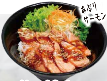
Aburi Salmon 17.6