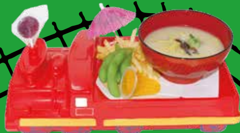
Kids Tonkotsu Ramen

All come with Chips, Edamame, Lollipop and Fruit Jelly