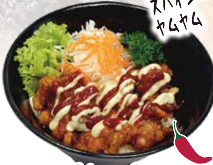
Yum Yum Spicy Chicken 15.8