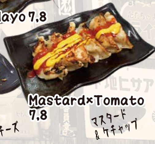
Mastard x Tomato 7.8 マスタード & ケチャップ