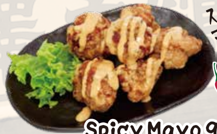
スパイシー マヨ Spicy Mayo 9.8