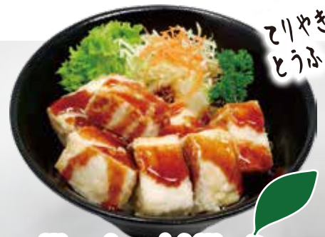
Teriyaki Tofu 14