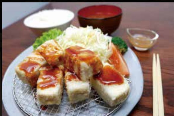
Teriyaki Tofu Zen 14.5 Teriyaki Tofu with Salad, Rice and Miso Soup