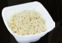
Extra Noodle 2