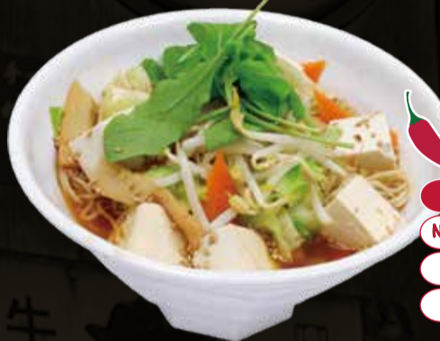
Daruma Vege Miso -VEGE MISO BROTH- 14.5

Tofu / Seasonal Veggies / Rocket Bamboo Shoot / White Sesame