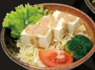
Tofu Salad 8