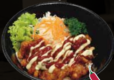
Yum Yum Spicy Chicken 15.8