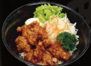
Teriyaki Chicken 15.8