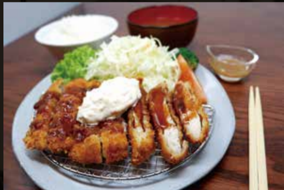
Chicken Katsu Zen 17 Chicken Katsu with Salad, Rice and Miso Soup