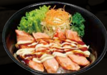
Wasabi Mayo Salmon 17.6