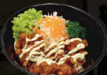
Wasabi Mayo Chicken 15.8