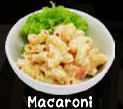
Macaroni Salad 6