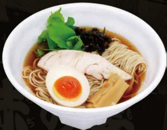
Nostalgic Japanese Soy -CHICKEN BROTH- 12.5

Chicken Chashu / Nitamago Egg / Bamboo Shoot / Yaki-Nori / Rocket