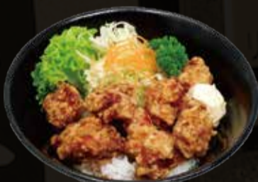
Chicken Karaage 14.8