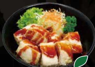
Teriyaki Tofu 14