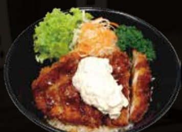
Chicken Katsu $16.8