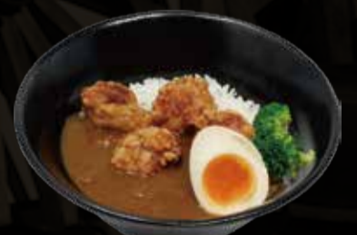
Chicken Karaage Curry 16.8