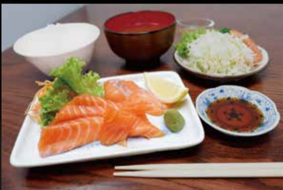
Salmon Sashimi Zen 16.5 Salmon Sashimi with Salad, Rice and Miso Soup