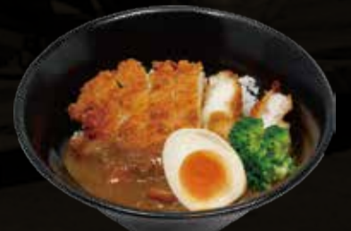
Chicken Katsu Curry 18.8