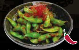
Spicy Edamame 7.4