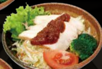
Chicken Salad 8