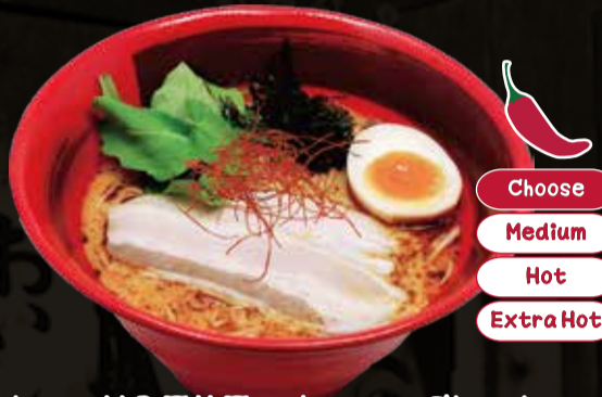
Oh my HOT!! Tonkotsu Chashu -PORK BROTH- 16.5

Pork Chashu / Nitamago Egg / Rocket / Black Fungus / White Sesame