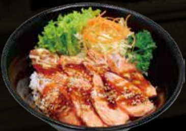
Aburi Salmon 17.6