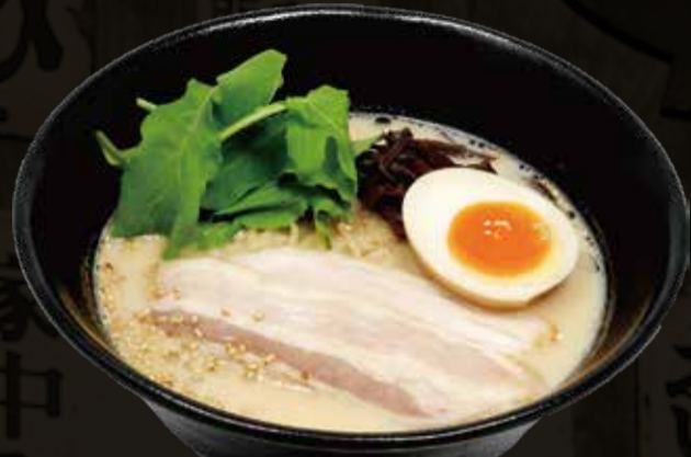
Signature Tonkotsu Chashu -PORK BROTH- 16

Pork Chashu / Nitamago Egg / Rocket / Black Fungus / White Sesame