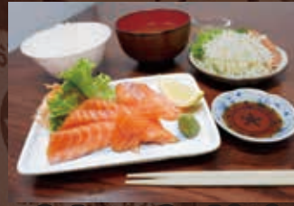
Salmon Sashimi 23.0