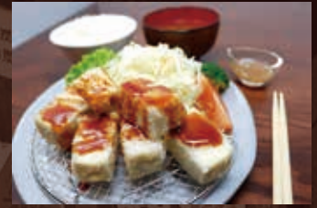
Teriyaki Tofu 19.0 (V)