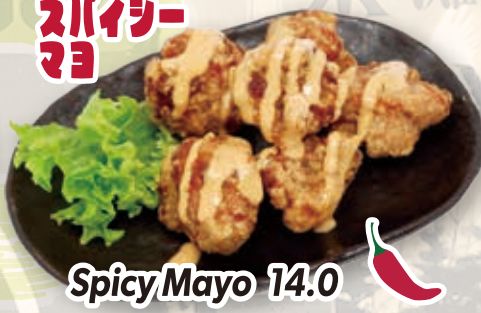
Spicy Mayo 14.0