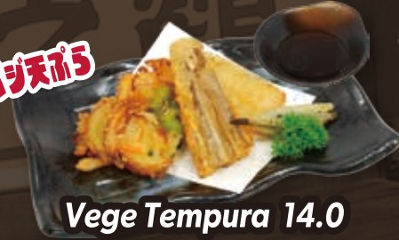
Vege Tempura 14.0