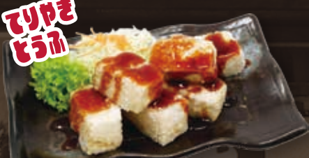
Teriyaki Tofu 10.0 (V)