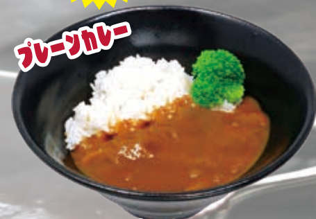
Plain Curry 15.8 (V)