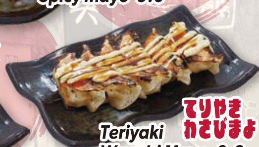
Teriyaki Wasabi Mayo 9.6