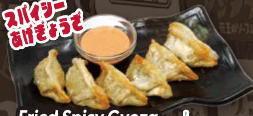
Fried Spicy Gyoza Dumpling 9.0 (V)