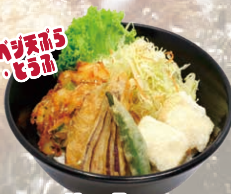
Vege Tempura & Teriyaki Tofu 18.0 (V)