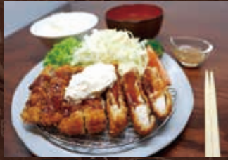
Chicken Katsu 24.0