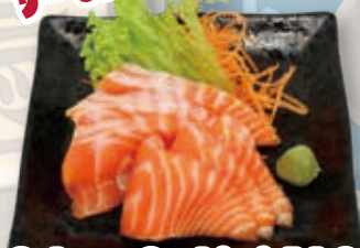
Salmon Sashimi 14.0