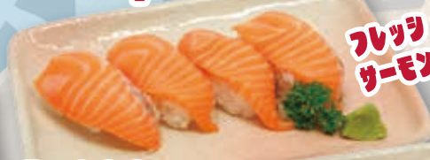
Fresh Salmon Sushi 13.0