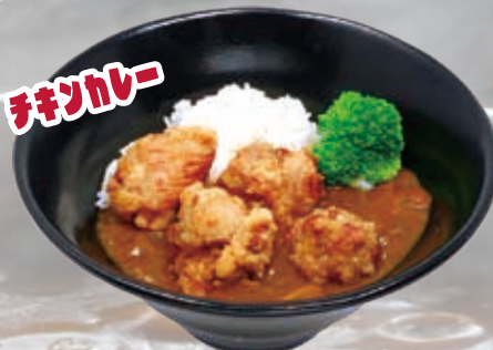
Chicken Karaage Curry 19.8