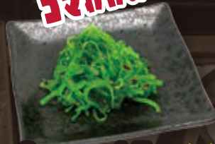
Seaweed 7.0 (V)