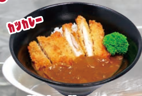
Chicken Katsu Curry 23.8