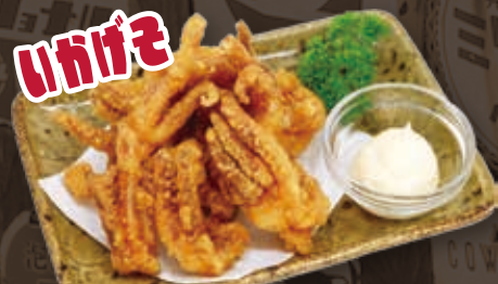
Squid Leg 12.0