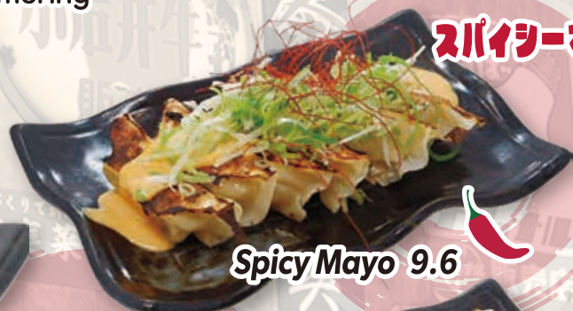
Spicy Mayo 9.6