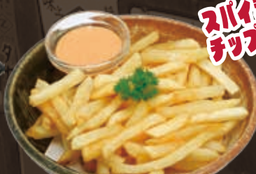
Spicy Yum Yum Chips 9.0