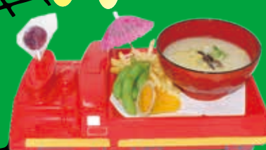
Kids Tonkotsu Ramen