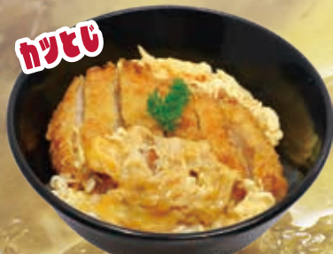
Chicken Katsu Egg 22.8