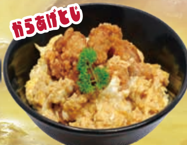
Chicken Karaage Egg 21.4