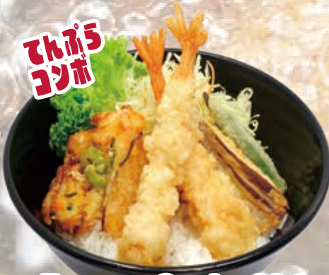
Tempura Combo 20.8