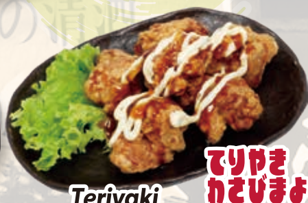
Teriyaki Wasabi Mayo 14.0