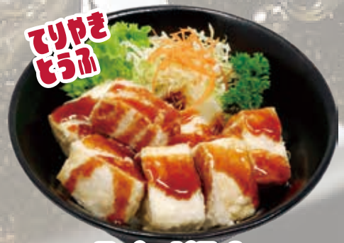
Teriyaki Tofu 17.4 (V)