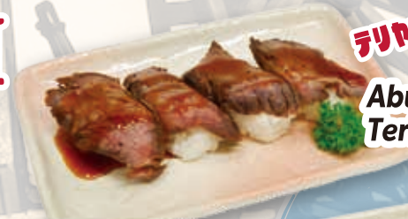
Aburi Wagyu Teriyaki 14.0