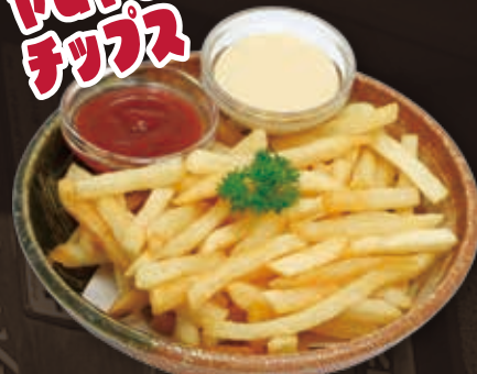
Yum Yum Chips 9.0