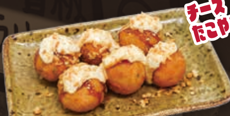
Cheese Takoyaki 10.0