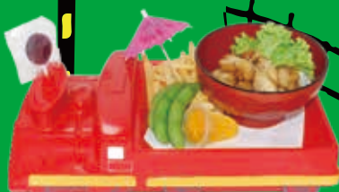
Kids Chicken on Rice