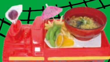
Kids Soy Ramen