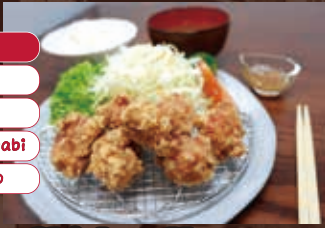
Chicken Karaage 22.0