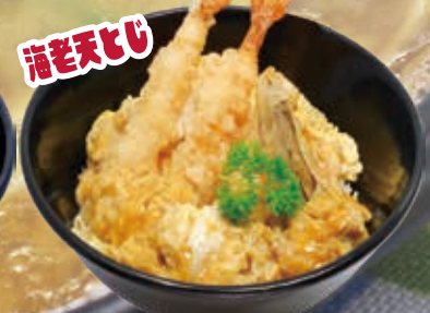
Prawn Tempura Egg 21.6