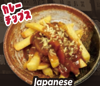
Japanese Curry Chips 9.0