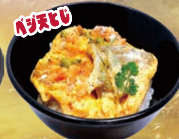
Vege Tempura Egg 18.0