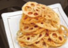
Lotus Root Chips 7.0 (V)