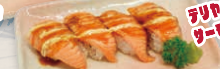
Aburi Salmon Teriyaki 14.0