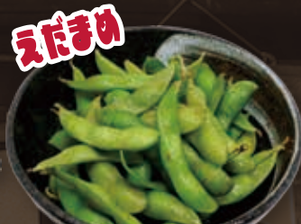
Edamame 8.0 (V)