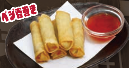
Vege Spring Roll 9.0 (V)