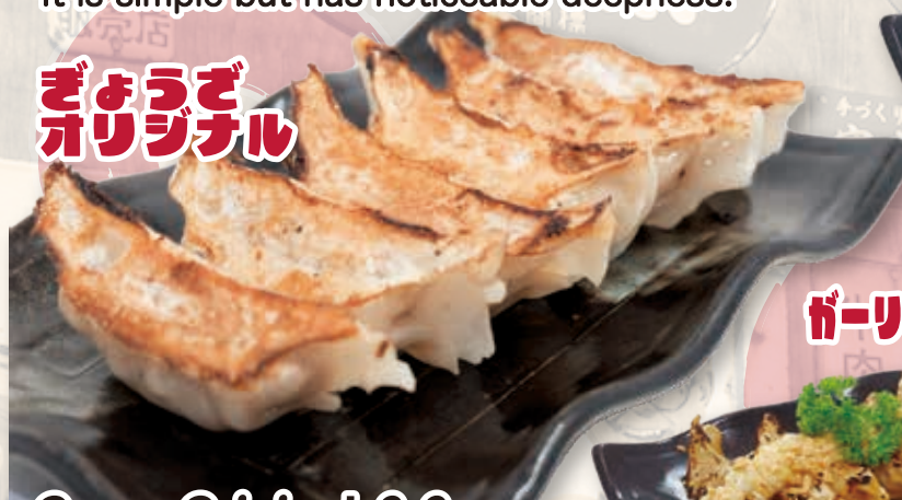
Gyoza Original 9.0