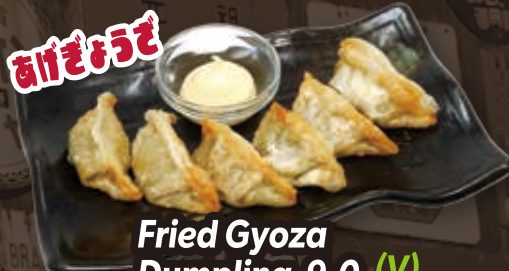
Fried Gyoza Dumpling 9.0 (V)