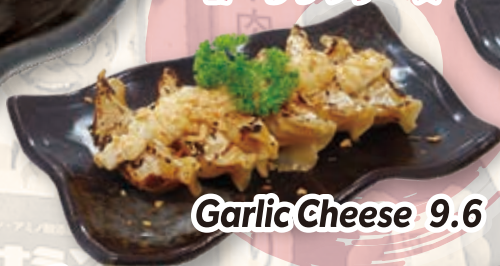
Garlic Cheese 9.6