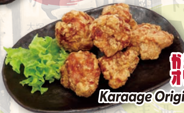
からあげ オリジナル Karaage Original 14.0

Juicy Chicken Karaage made with Daruma's signature recipe.