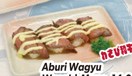
Aburi Wagyu Wasabi Mayo 14.0