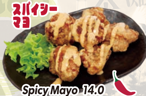
スパイシー マヨ Spicy Mayo 14.0