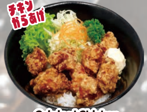
Original Chicken Karaage 18.4