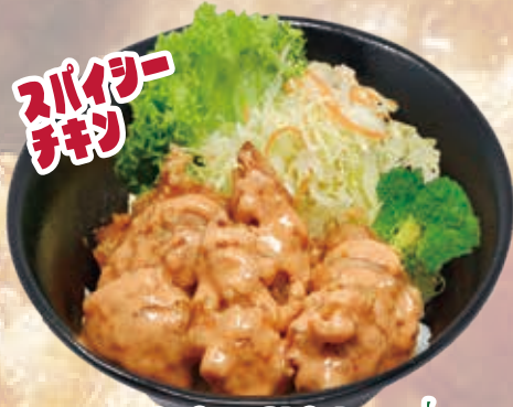
Spicy Chicken Karaage 19.4