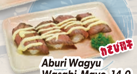
Aburi Wagyu Wasabi Mayo 14.0