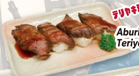
Aburi Wagyu Teriyaki 14.0