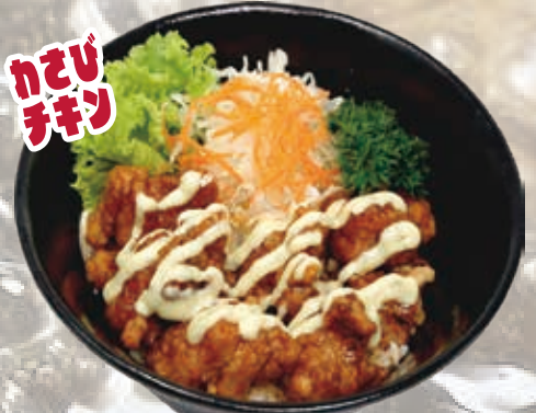
Wasabi Chicken Karaage 18.4