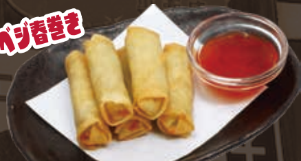
Vege Spring Roll 9.0 (V)