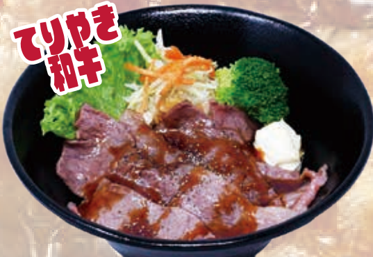
Teriyaki WAGYU 23.8