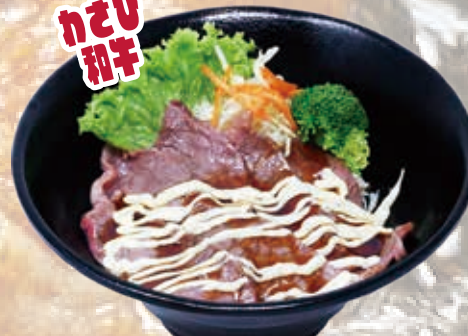
Wasabi WAGYU 23.8