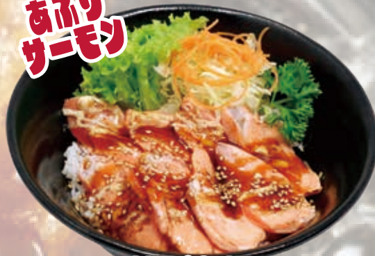
Aburi Salmon 22.8