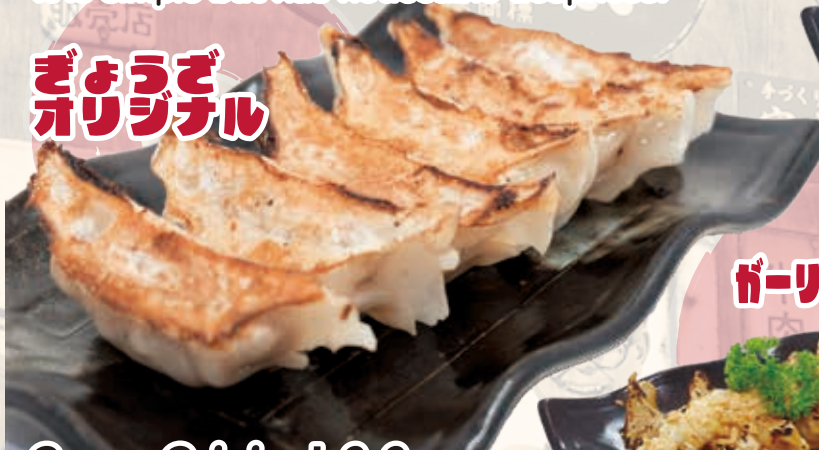
ぎょうざ オリジナル Gyoza Original 9.0

It has a unique, full flavour as it is housemade while using Japanese method. We use top-grade chicken stock made from simmering a whole chicken which results in a very rich Umami-flavoured stock. It is simple but has noticeable deepness.