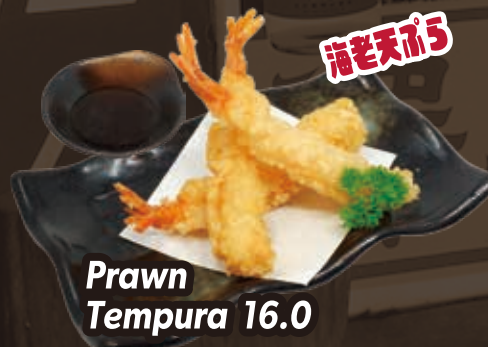
海老天ぷら Prawn Tempura 16.0