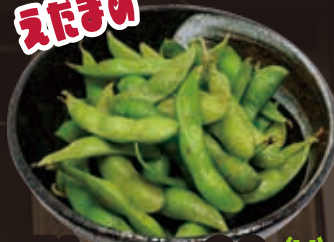
Edamame 8.0 (V)