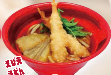
Prawn Tempura Udon 18.0