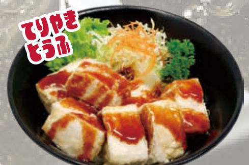
Teriyaki Tofu 17.4 (V)