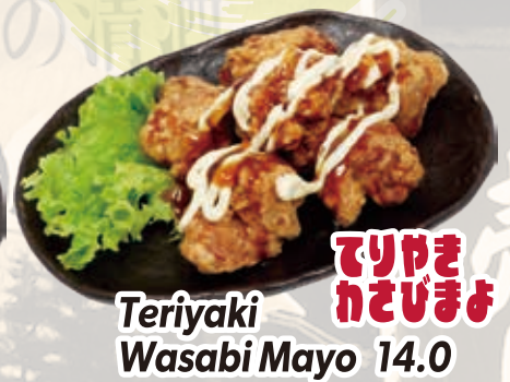
てりやま かえびまよ Teriyaki Wasabi Mayo 14.0