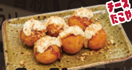
Cheese Takoyaki 10.0