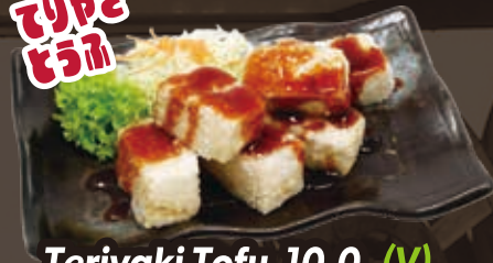
Teriyaki Tofu 10.0 (V)