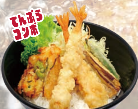
Tempura Combo 20.8