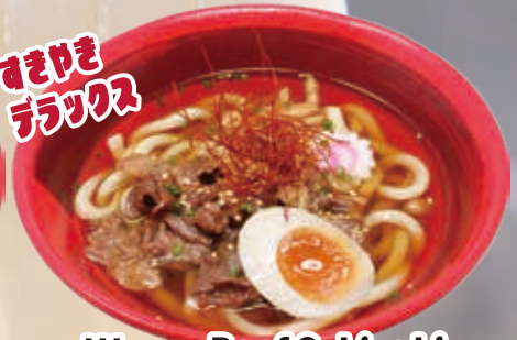
Wagyu Beef Sukiyaki DLX Udon 19.8