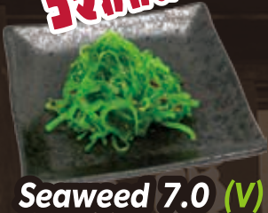
Seaweed 7.0 (V)