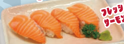
Fresh Salmon Sushi 13.0