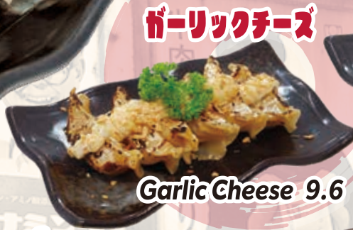
ガーリックチーズ Garlic Cheese 9.6