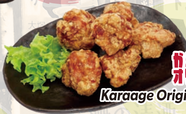
からあげ オリジナル Karaage Original 14.0

Juicy Chicken Karaage made with Daruma's signature recipe.