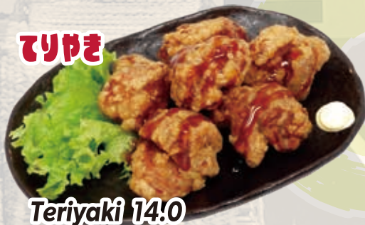
てりやま Teriyaki 14.0