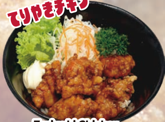
Teriyaki Chicken Karaage 18.4