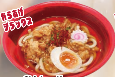
Chicken Karaage DLX Udon 19.8