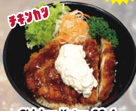
Chicken Katsu 22.4