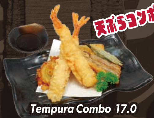
天ぷらコンボ Tempura Combo 17.0