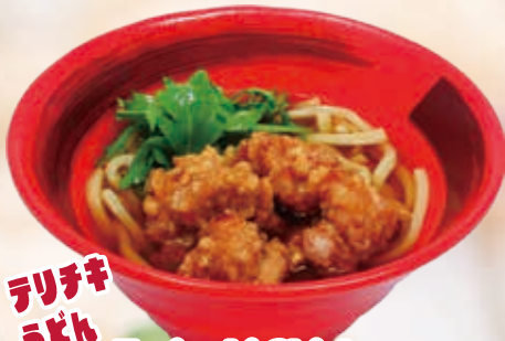
Teriyaki Chicken Udon 18.0