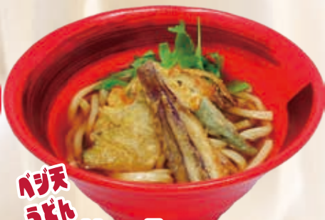
Vege Tempura Udon 17.0 (V)