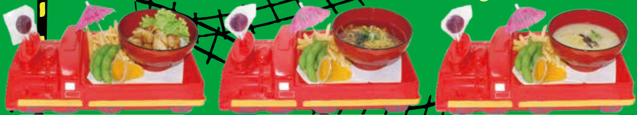
Kids Chicken on Rice