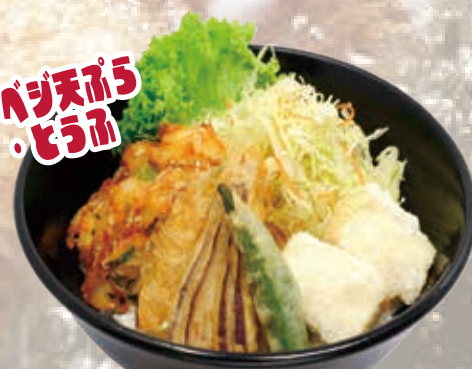
Vege Tempura & Teriyaki Tofu 18.0 (V)