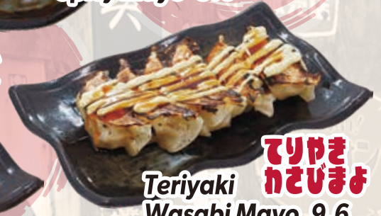
てりやま かえびまよ Teriyaki Wasabi Mayo 9.6