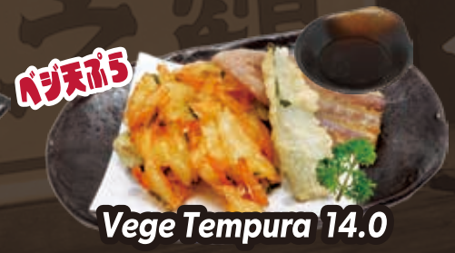
ベジ天ぷら Vege Tempura 14.0