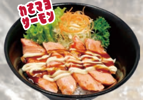
Wasabi Mayo Salmon 22.8