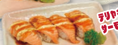
Aburi Salmon Teriyaki 14.0