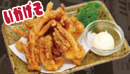
Squid Leg 12.0