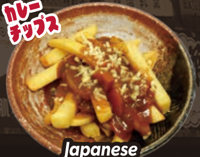
Japanese Curry Chips 9.0