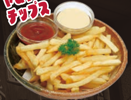
Yum Yum Chips 9.0