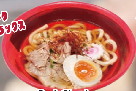
Pork Chashu DLX Udon 19.8