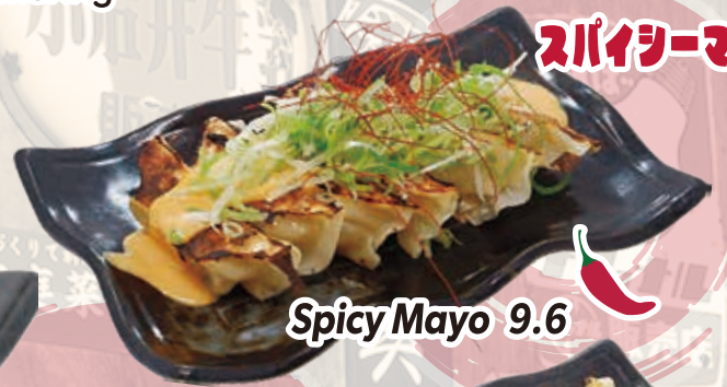
スパイシーマヨ Spicy Mayo 9.6