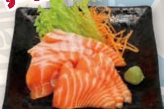
Salmon Sashimi 14.0