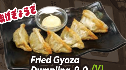
Fried Gyoza Dumpling 9.0 (V)